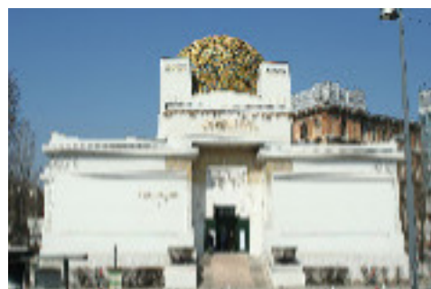
Pavillon de la Seceession (Joseph Maria Olbrich) 1897