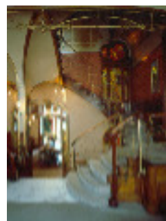
Maison Horta (Horta) 1898