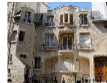
Hotel Mezzara (Guimard Hector) 1910