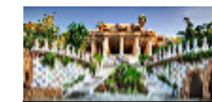
Parc Guell (Gaudi) 1914