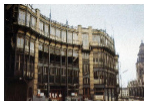
Maison du peuple (Wagner) 1895