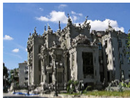
Maison aux chimeres (Vladyslav Gorodetsky) 1902