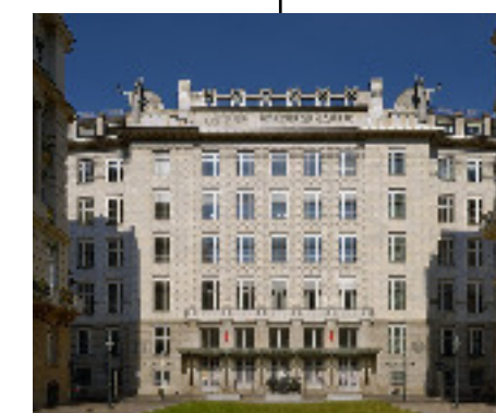
Caisse d'Epargne de la poste (Georg-Coch-Platz) 1912