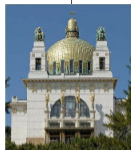
Eglise St Leopold (Wagner) 1904