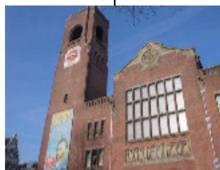
Bourse (Berlage) 1900