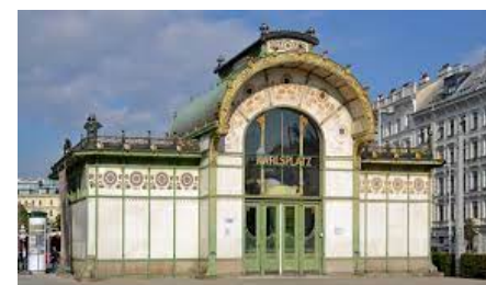
Pavillon am Karlsplatz (Wagner) 1899